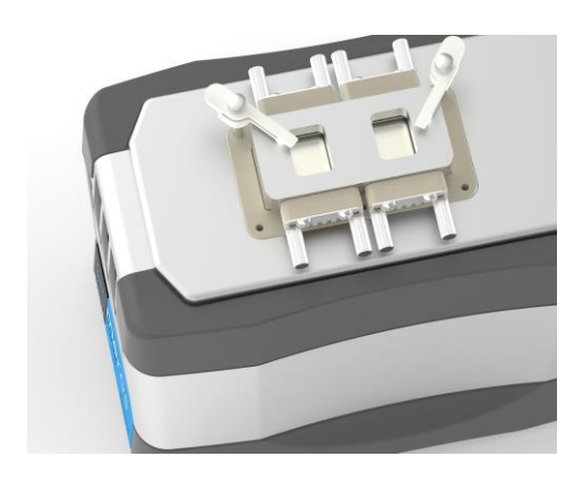
H Interface Temperature Control Unit (Part No. 3200429)

The H Interface Temperature Control Kit enables microfluidic experiments utilising the precise thermal control of the TCU-100 with a range of droplet junction, droplet merging and Y-junction chips. Compatible with the popular and economical 15 x 22.5 x 4 mm chip format, 2x Linear Connector 4-way (Part No.3000024) and H Interface (Part No. 3000155), this kit features a heat plate adaptor and insulative cover for 2 microfluidic set-ups in parallel. Good thermal contact is ensured by mounting the H Interface Temperature Control Kit using the Sample Clips provided with the TCU-100 (Part No. 3200430).