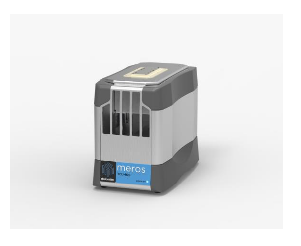
Meros TCU-100 (Part No. 3200428)

The Meros TCU-100 has a hot/cold plate area of 60mm x 22.5mm and comes with 4 optional, flexible sample clips. Holes in the plate allow dowel pins to be mounted for chip alignment. This combination enables a wide range of chips (including non-Dolomite chips), microscope slides or other devices to be quickly and securely held in place ensuring excellent thermal contact. The TCU-100 is compatible with chip and microscope sizes up to 25 x 75mm. Standard chip sizes such as