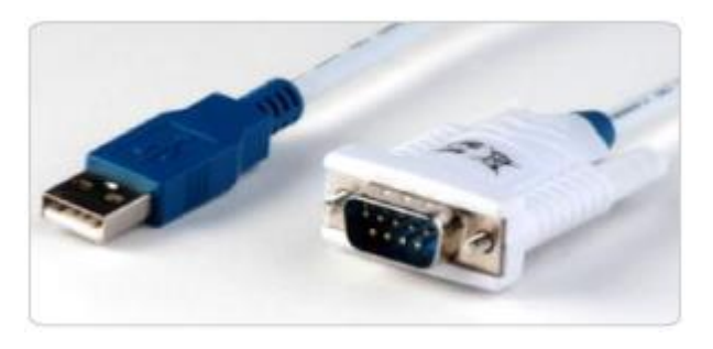
USB to RS232 Adaptor Cable (Part No. 3200197)

For PCs that do not have an RS232 serial interface, Dolomite offers a RS232 to USB Adaptor Module cable which allows users to connect their Meros TCU-100 to a PC.