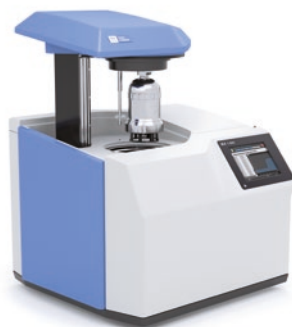
C 6000 Oxygen bomb calorimeter Ident-Nr. 008804300

If required, the following IKA devices are available for your lab to enhance tempering using the Oven 125 basic and control: