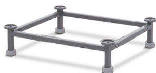
Stacking Frame To stack the ovens Ident. No. 0035001326