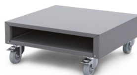
Base cabinet on wheels For mobile use Ident. No. 0020007602