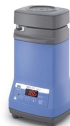
A 10 basic Batch mill Ident-Nr. 0004020700