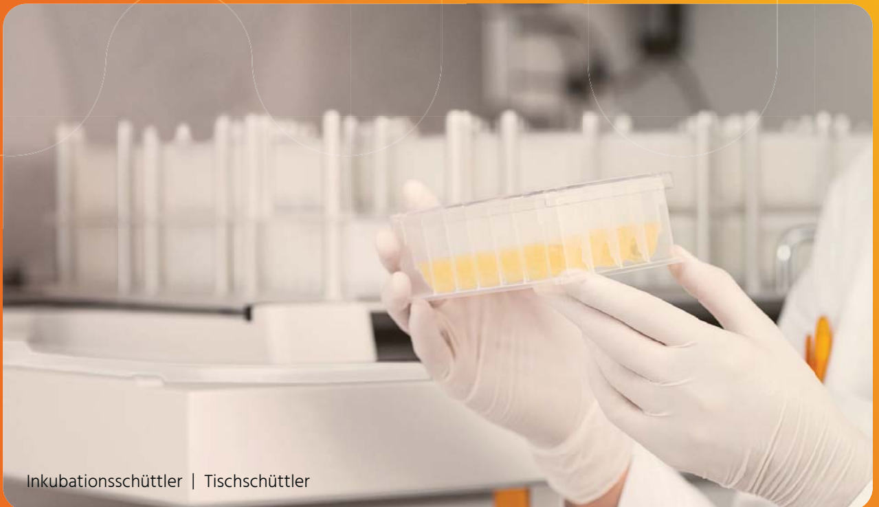
Inkubationsschüttler | Tischausschüttler

All our models feature an ergonomic design, intuitive programming as well as a large overall capacity.