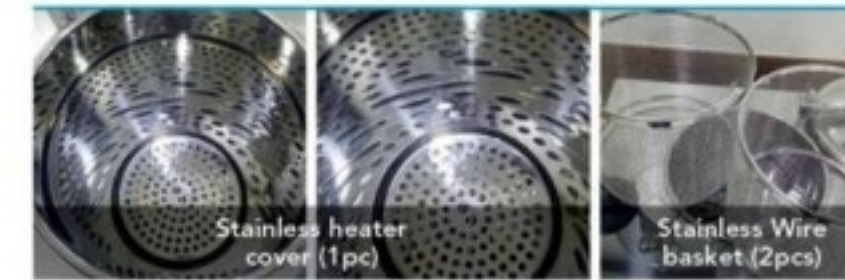
Stainless heater cover (1pc)