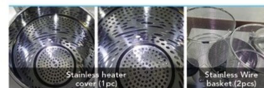
Stainless heater cover (1pc)