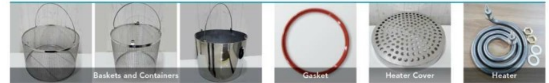
Baskets and Containers