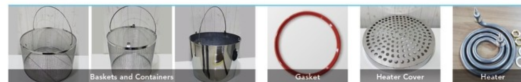
Baskets and Containers