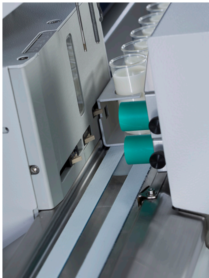
Up to 600 samples per hour handled with minimal cleaning and maintenance work

The sample ID system supplied with the CombiFoss 7 is designed to make the job of controlling samples and sample data as simple as possible. It supports both barcode and RFID sample identification concepts. A modular design ensures ease of cleaning and maintenance including a sample conveyor that does not require use of compressed air. An intelligent pipette system improves safety by detecting closed lids on samples bottles.