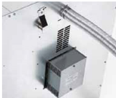
Underbench installation kit

Custom solutions available for table top ovens cable testing applications, clean room applications, and inner casing with conditional gas-tightness for inert gas applications. Access ports can be provided for large capacity ovens at preferred positions