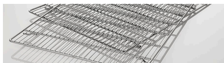
Wire mesh shelves