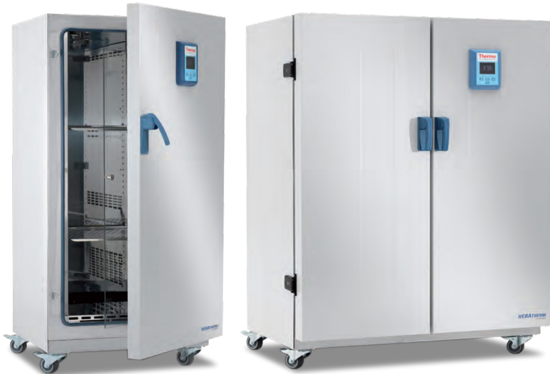
Heratherm large capacity ovens are available as 400 L and 750 L units

Heratherm large capacity ovens have been designed with your need for larger samples or high sample volume in mind. The General Protocol ovens provide high capacity for day-to-day drying and heating applications.