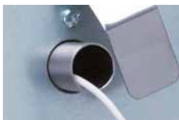
Rear view of the 100 L Advanced Protocol Smart-Vue Wireless Monitoring Solution