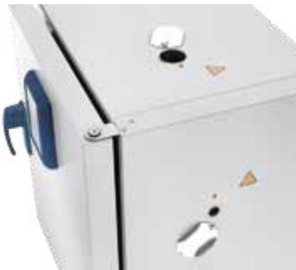
Additional access ports top and right